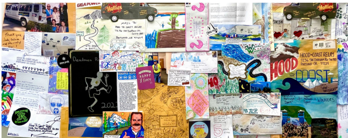
Team Application Envelopes from the 2022 Lottery

Hood To Coast uses a lottery system. Your team captain will submit an application online before the day of the lottery (the lottery takes place in early October). On the day of the lottery, your team captain will mail a printed copy of the online submission form to the HTC office: 7236 SW Durham Rd, Portland, OR 97224. Envelopes will be chosen at random! If your envelope is chosen, you will receive confirmation via email. At this time, the credit card you registered with will be charged. The registration fee is nonrefundable.