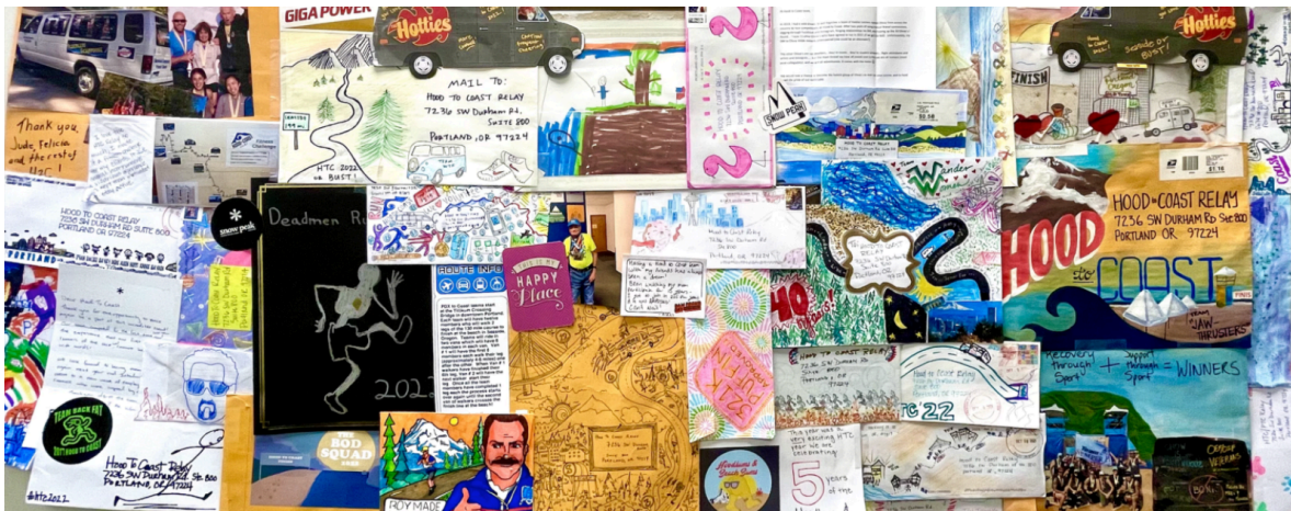
Team Application Envelopes from the 2022 Lottery

Portland To Coast Walk team registration is on a rolling basis through October, with Hood To Coast on a lottery system. Your team captain will submit an application online before the day of the lottery (the lottery takes place in early October). On the day of the lottery, your team captain will mail a printed copy of the online submission form to the HTC office: 7236 SW Durham Rd, Portland, OR 97224. Envelopes will be chosen at random! If your envelope is chosen, you will receive confirmation via email. At this time, the credit card you registered with will be charged. The registration fee is nonrefundable.